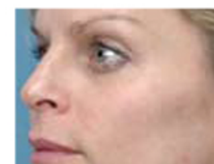
Post 5 treatments