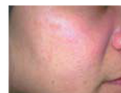
Post 1 treatment