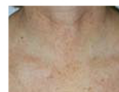
One month post 1 treatment